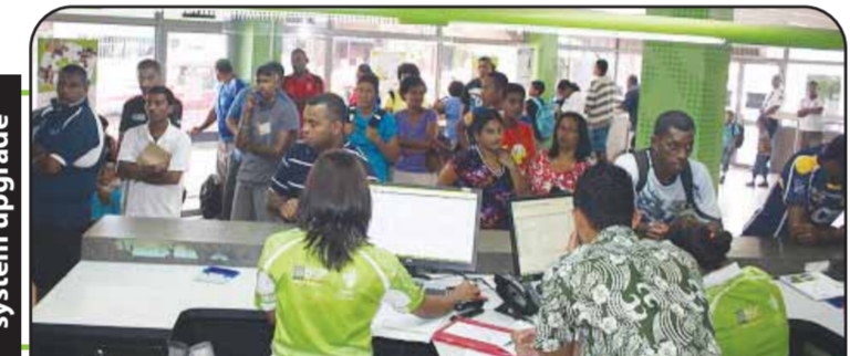
Thanks to our system upgrade, BSP Saturday Banking operations went national for a promotional period where customers received instant approvals for loans valued at less than $5,000.