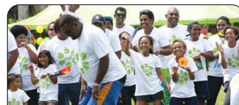
Family is an integral part of our values. Here, they are all enjoying our annual family fun day held at Gospel High School grounds.